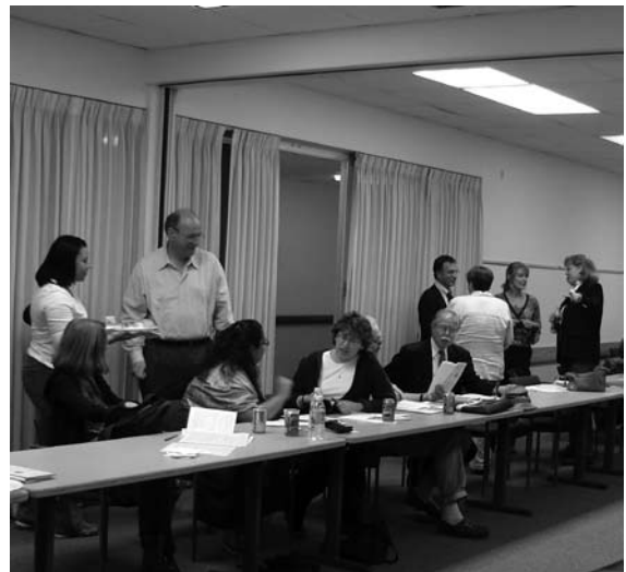
Adjunct Faculty Negotiating team members from WPUNJ, NJCU and MSU discussing proposals.