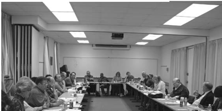
Full Time/Part Time Negotiating Team in Caucus