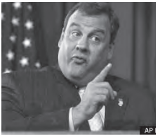
Governor Chris Christie