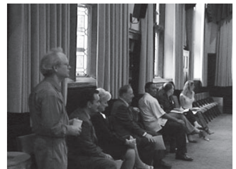
NJCU legislative breakfast attendees

professional staff as well as local officers and members of the Student Government’s Executive Board. She commented that “Our Hudson County state legislators are very strong supporters of public higher education. This morning’s informal event was a wonderful opportunity to thank them for their support.”