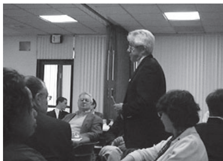
MSU Local 1904 legislative breakfast attendees

then take questions from the floor. At William Paterson and Montclair, some legislators spoke while others listened. At NJCU a legislator took the opportunity to announce his intention to introduce legislation to help finance new construction. At some campuses, the college/university presidents were also invited to speak, but these were clearly AFT events, in which our issues and concerns took precedence—funding, state oversight, student aid, increasing the ranks of full time faculty and upgrading the status of adjunct faculty.