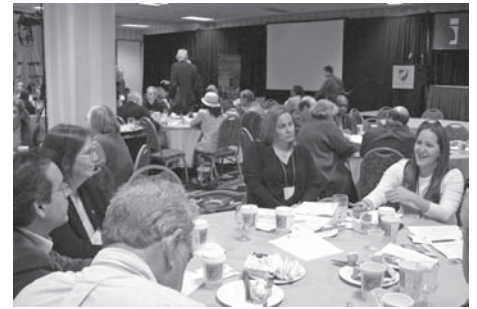
MSU Delegates working on student outcomes in breakout session