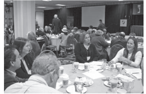
MSU Delegates working on student outcomes in breakout session