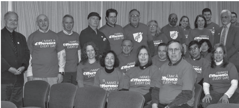
“We Are One” at MSU

rights and benefits. It’s a great thing to be able to involve students in union-related activities to talk about labor history — the struggles and hard-won victories — and engage students in discussions about the new onslaught against unions and collective bargaining. The April 4 th We Are One events provided students with an understanding of how the collective power of organized labor is as vital and necessary today as it was in previous generations.