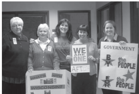
Ramapo “We Are One” in library

Council Locals stood tall during the We Are One week, celebrating the labor movement and higher education by calling attention to AFT’s proud role in fighting for collective bargaining rights in public higher education and rising to the challenges posed by legislators and right-wing extremists who would take away hard won bargaining