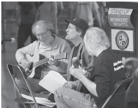
Members from Stockton Faculty Band

At Montclair State University, Local 1904 members dedicated April 4 th to contacting their NJ state legislators to demand that our health care benefits be negotiated at the bargaining table rather than legislated. On April 6 th , the local encouraged AFT unit members to don a blue AFT t-shirt and buttons to show their soli-