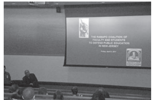
Packed Lecture Hall Teach-in at Ramapo