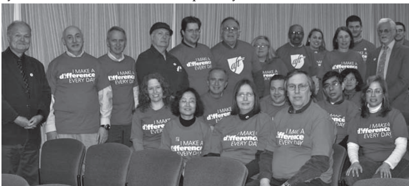
“We Are One” at MSU

rights and benefits. It’s a great thing to be able to involve students in union-related activities to talk about labor history — the struggles and hard-won victories — and engage students in discussions about the new onslaught against unions and collective bargaining. The April 4 th We Are One events provided students with an understanding of how the collective power of organized labor is as vital and necessary today as it was in previous generations.