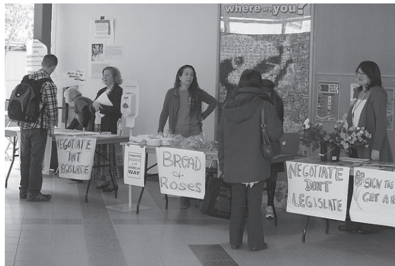
Stockton Faculty & Staff

Richard Stockton College AFT Local 2274 staged a day-long teach-in and staffed informational leafleting tables. AFT members gave talks on several subjects, including legislative issues, bargaining rights, the economic crisis in higher education and union solidarity.