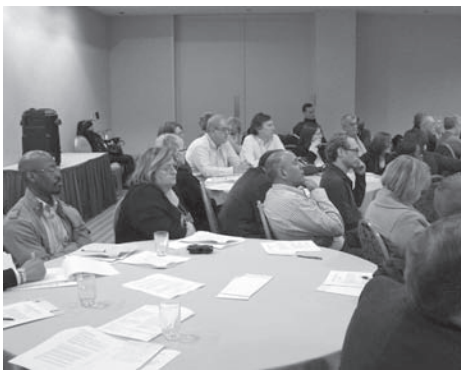
Rowan & MSU delegates at "Legal Issues" workshop.