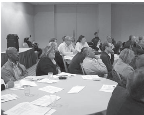
Rowan & MSU delegates at "Legal Issues" workshop.